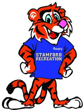
Summer Fun at Camp!

Camp hours are Monday through Friday from 9:00 AM - 1:00PM WELCOME TO CAMP!